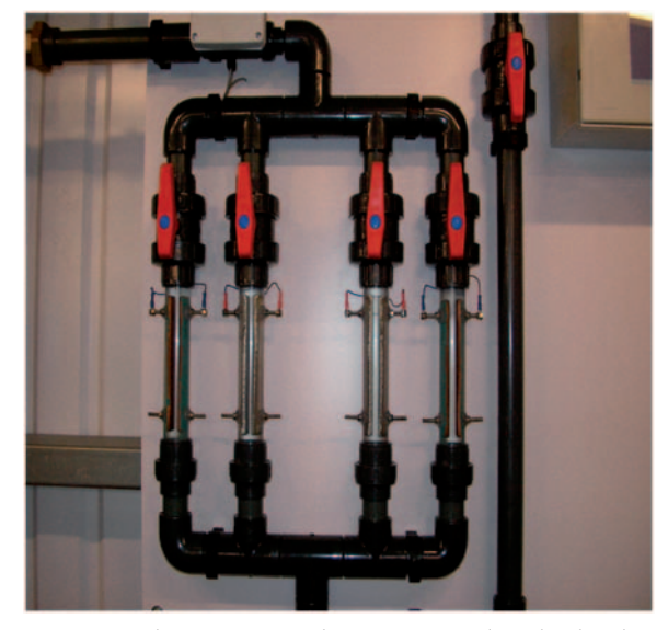
Figure 3. Copper-silver ionization system showing two copper and two silver electrodes

A system of copper–silver ionization (ProEconomy Limited, Bedfordshire, UK) was installed in February 2008, at the point of the mains water supply prior to entering the storage tanks (Figure 3). Table 3 shows the water analyses results of ANC-23 following installation of the copper–silver ionization system.